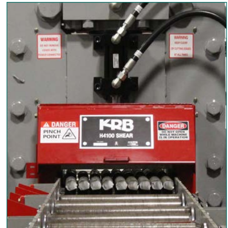
9 pieces of #14 (45mm) bars.