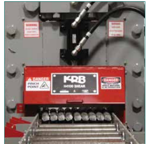
9 pieces of #14 (45mm) bars.