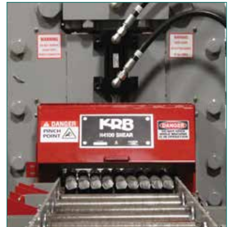
9 pieces of #14 (45mm) bars.